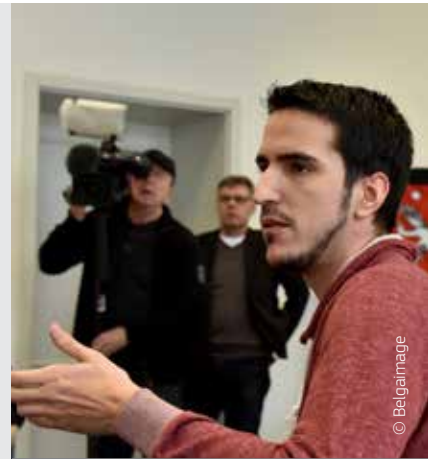
Skills and migration: the cost of non-integration is greater than that of effective integration.

The initiative was launched at the second European Dialogue on Skills and Migration, taking place in the margins of the European Business Summit. "The cost of non-integration is far greater in the long run than the cost of effective integration policies", European Commissioner Thyssen stated. "Everyone who is rightfully in the EU should have the opportunity to participate fully in our economic, cultural and social life. However, we need to keep in mind the specific challenges that refugees and migrants coming from outside the EU face". All interested companies can support the initiative and sign up.