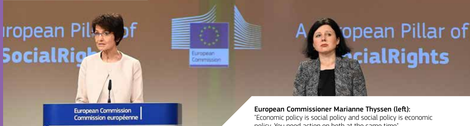
European Commissioner Marianne Thyssen (left): "Economic policy is social policy and social policy is economic policy. You need action on both at the same time".