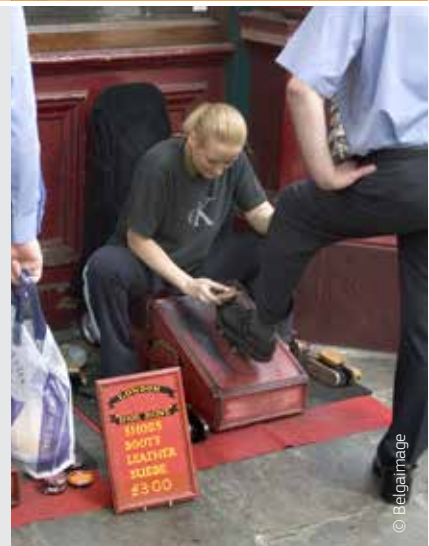
Wage inequalities: One million signatures are required from 7 countries within one year for the European Commission to have to react to this citizens' initiative.

The European Commission has decided to make a partial registration of a European Citizens' Initiative which invites the Commission to propose "legal acts that clearly demonstrate the EU's intention to eliminate wage inequalities between Member States and which - to achieve this objective - allow for a more efficient cohesion of these states". In so doing, it started a one-year process of collection of signatures of support by its organisers. Should the Initiative receive one million statements of support within one year, from at least seven different Member States, the Commission will have to react within three months. The Commission's Decision makes clear for which kind of legal acts the signatures may and may not be collected in this case, dependent on the competences set out in the Treaties.