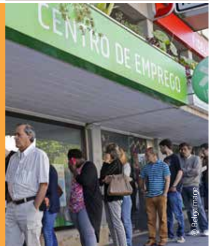
Globalisation adjustment: EGF co-funding has supported 138 888 redundant workers and 2 944 people not in employment, education or training since 2007.

Ten years ago, the European Globalisation Adjustment Fund (EGF) began its operations. "The fund is a practical demonstration of European solidarity because it gives financial support to Member States to help workers and companies adjust in response to changing patterns of trade. During the last ten years we were able to support more than 140 000 people", European Commissioner Marianne Thyssen stated. "It has a clear added-value because it tops up national support mechanisms for workers involved in mass lay-offs, and funds measures that are tailored to workers' specific needs in order to help them move on." Since its establishment in 2007, the Commission has received 148 applications from 21 Member States, totalling almost €600 million of EGF co-funding in support of 138 888 redundant workers and 2 944 persons not in employment, education or training (see page 6).